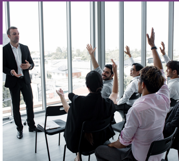
Case Study #5 Niche Tech Staffing

Summary: Raising awareness on 4.5 and 5G technology among senior engineers and C-suite executives of leading Southeast Asian telecom companies. The program specially covered network redeployment in New Radio, new towers, and backhaul fibre optics.